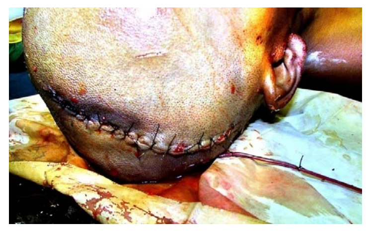
Fig. 10: Closure of the hemicoronal flap and insertion of drain