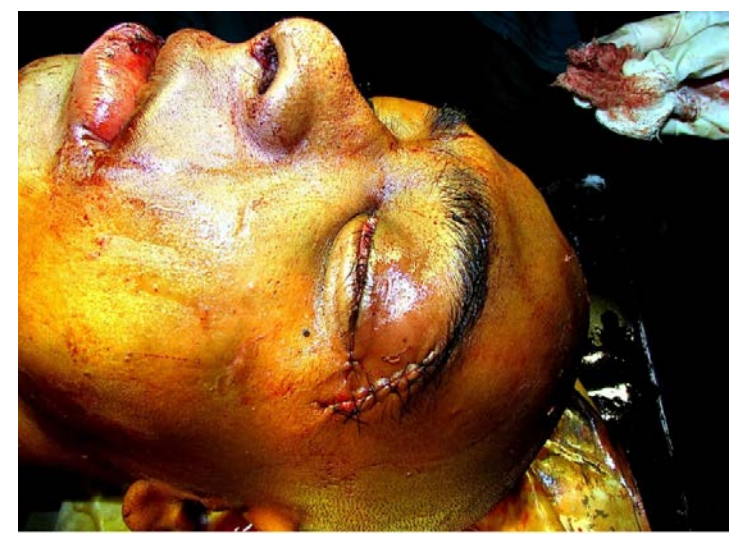
Fig. 11: Closure of the lateral canthotomy and lateral eyebrow incisions