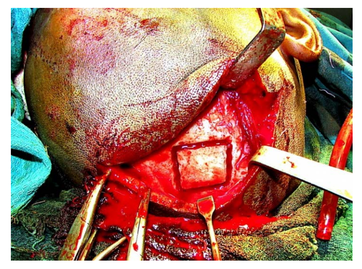
Fig. 6: Hemi-coronal flap elevated and outlining the design of the calvarial graft