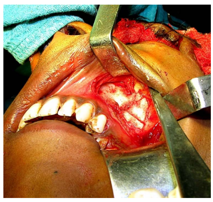
Fig. 5: Intra oral exposure of the Zygomaticomaxillary buttress area