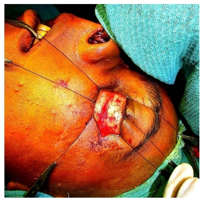
Fig. 3: Transconjunctival incision with lateral canthotomy