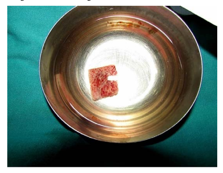
Fig. 7: The harvested split thickness calvarial bone graft