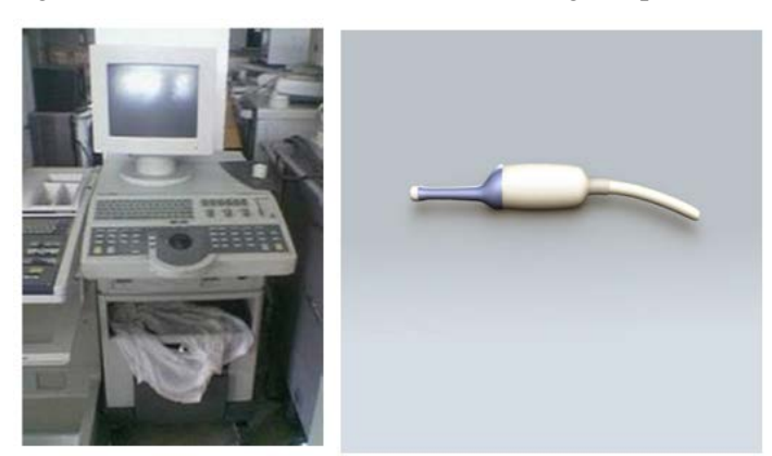
Figure 1: Ultrasound machine with transvaginal probe