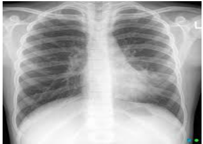
Figure 1: Chest radiograph on day 1 showing infiltrates in left lower zone.

Chest radiograph revealed findings suggestive of pulmonary oedema. 2D-ECHO showed dilated left Atrium and dilated left Ventricle along with severe generalised left ventricular hypokinesia with moderate Mitral regurgitation and left ventricular ejection fraction at 15%. (Figure 2)