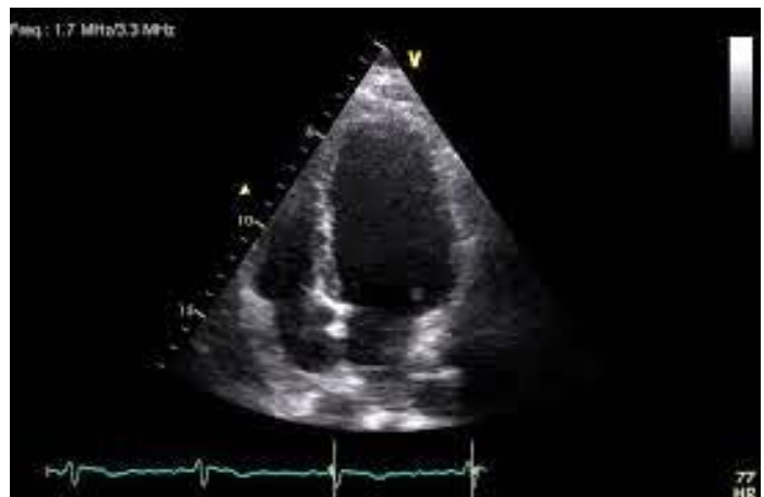
Figure 2: 2D-ECHO of patient on second day of admission.

The i.v. fluids were immediately discontinued and patient was administered inotropes, dopamine, dobutamine along with diuretic furosemide. After 48 hours, patient's ventilator requirement showed gradual improvement. After 2 weeks, 2D-ECHO was done again and it showed normal ejection fraction. Peripheral smear on 15 th day showed negative malarial parasite report. Patient was subsequently discharged and was advised to rest for 1 week.