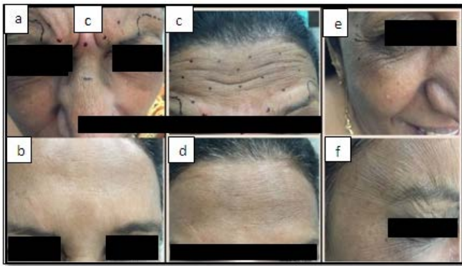
Figure 3: Clinical photographs: (a) glabellar frown lines pre-operative, (b) glabellar frown lines post-operative, (c) horizontal forehead lines pre-operative, (d) horizontal forehead lines post-operative, (e) crow's feet lines pre-operative and (f) crow's feet lines post-operative.