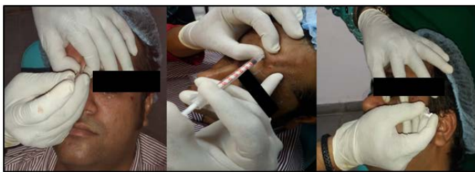
Figure 2: Injection procedure (a) glabellar frown line, (b) horizontal forehead lines, (c) the lateral canthal lines (crow's feet).

In the lateral canthal lines (crow’s feet), medial and lateral extent of wrinkles were evaluated (Figure 1.c). A snap back test or lower retraction test performed to assess the lower lid resiliency. 3-4 subcutaneous injections were applied, approximately 1 cm lateral to the lateral orbital rim, using 2-3 units per injection site (total of 6- 12 U per side). Sites were spaced 2 cm apart in vertical line or slightly curving arch. Patients were advised to close the eyes during entire procedure. (Fig. 2 c)