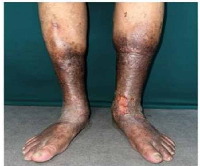
Figure 6: Active venous ulcer over medial malleolus