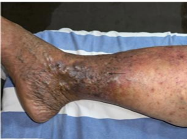
Figure 5: Atrophic Blanche