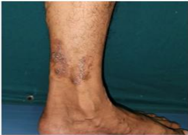
Figure 3: Stasis eczema and varicosities