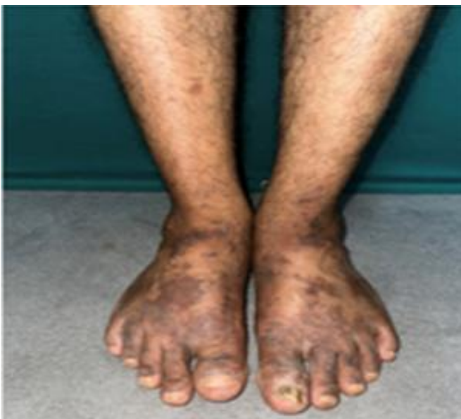
Figure 4: Stasis Eczema