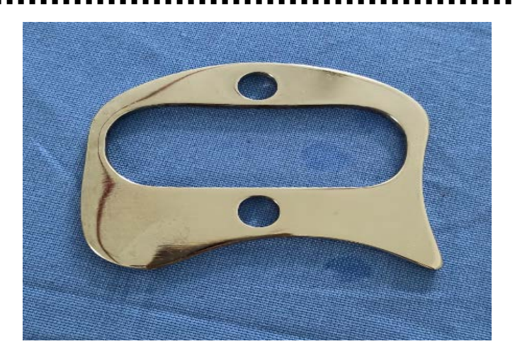
Fig. 2: IASTM