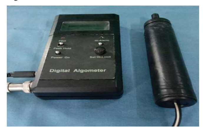
Fig. 3: Pressure Algometer