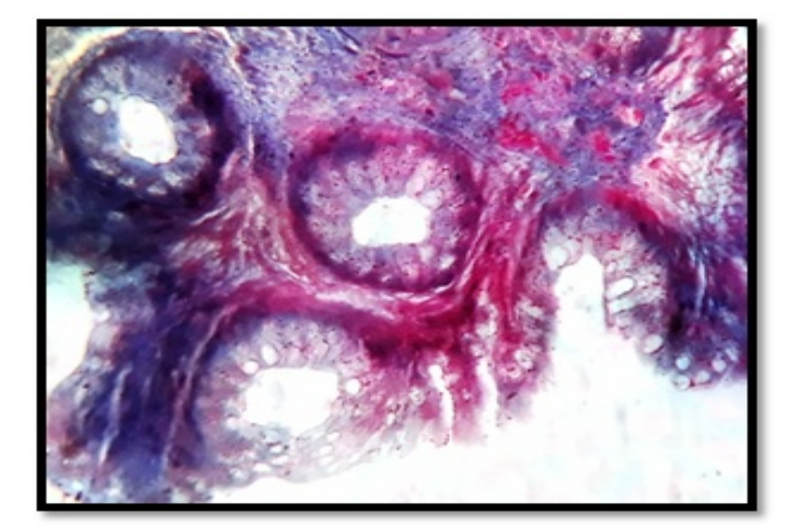
Figure 2: Photomicrograph of solitary rectal ulcer showing splaying of muscle fibres (Masson Trichrome H&E 400X)