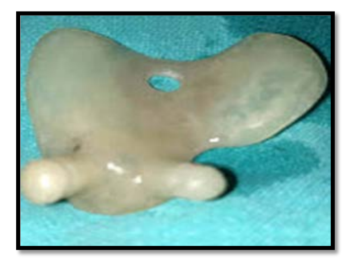
Figure 1: PNAM Appliance (Pandey Ret al.)<sup>21</sup>

A silicone nasal conformer suggested by Matsuo and Hirose can be used as a tool for presurgical nasal molding when the patient has an incomplete CL. The height of the conformer can be adjusted by gradually adding some soft resin or flat silicone sheets on the domes. This is a method to increase the columella height gradually by adding silicone sheets to the domes of the nasal stent. It can be used for presurgical elongation of the columella in incomplete clefts or postoperative maintenance of the nostril configuration.<sup>1,20</sup>