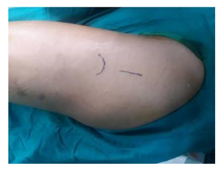
Figure 2: showing incision

Incision: In both PFN & PFNA-II, incision was made over the lateral aspect of the proximal thigh over the greater trochanter extending up to 5cm proximally. Incision was deepened to split the subcutaneous layer and fascia and then gluteus muscles were split apart using a curved clamp with cauterisation of bleeding vessels.