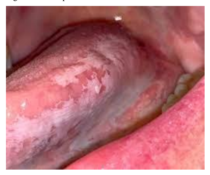
Figure 3: Mucocele Fibroma