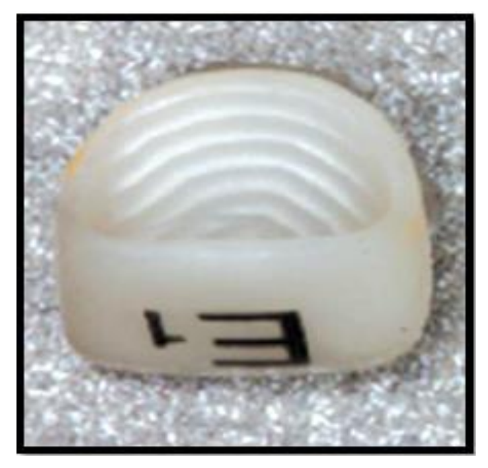
Figure 1: Zirlock inside the EZ crown

It comes with the patented retention technology "zir– lock" i.e., retentive grooves which extent all the way to the crown margins, preventing cement washout. It also prevents entry of harmful bacteria and moreover it provides two times more surface area for bonding. Additional retention is provided through blasting with Aluminum oxide.<sup>15</sup>