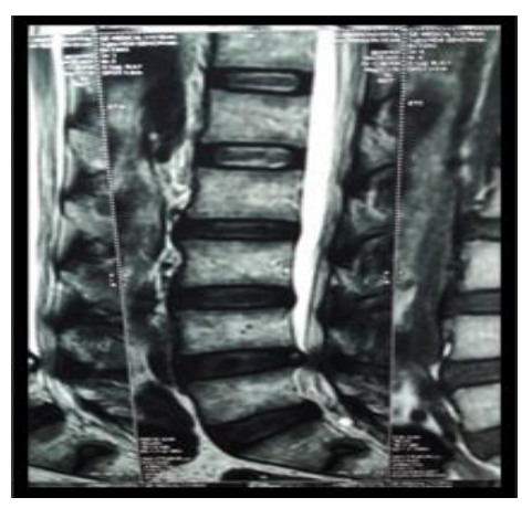
Fig 1: Spinal Cord compressed between lumbar vertebra 4 and 5 due to disk thickened Ligamentumflavum

and close observation of these cases is necessary in post operative period (10).