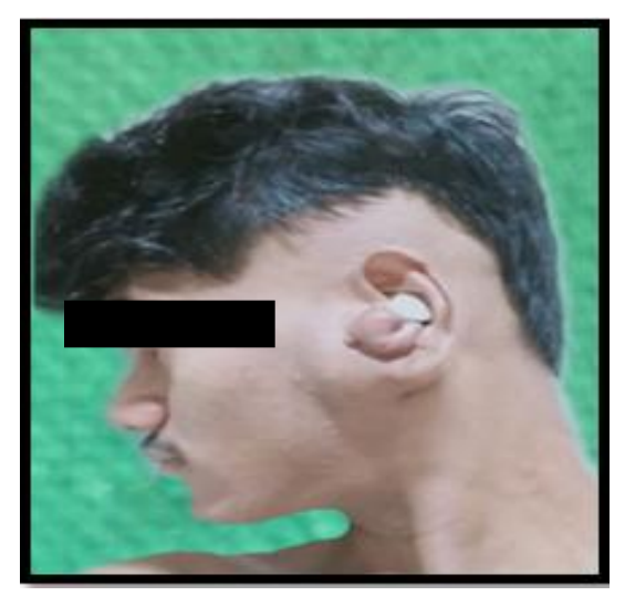
Figure 1: Clinical photo of patient showing swelling over left preauricular region and external ear.

A 16-year-old male patient presented to the Outpatient Department (OPD) with the complaint of swelling in front of the left ear for the past 3 years which was insidious in onset and gradually progressive in size. There was no associated neck swelling, puffiness or swelling around eyes or generalized body edema. Occasionally he had itching over the swelling. On examination, a 5x3cm lobulated, non-tender, firm bilobed mass was seen in left preauricular region involving the tragus as well. Skin overlying the swelling was normal and there was no local rise of temperature. The edges of the swelling were clearly defined with no visible pulsations seen over the surface. It was non fluctuant, non-reducible and compressible. Otoscopic examinations revealed normal findings. There was no other significant finding on systemic or local examination. The medical history of the patient did not reveal any significant history.