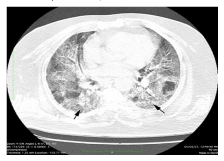
Figure 4: Axial section of HRCT Chest of 56-year-old male after 1 dose of Covaxinshow confluent areas of ground glass opacities with interstitial septal thickening noted diffusely in bilateral lower lobes. (CTSI = 23/25)

male after 2 doses of Covaxin show focal subpleural ground glass opacities in posterior basal segment of right lower lobe. (CTSI = 6/25)