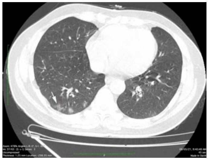
Figure 3: Axial section of HRCT Chest of 56-year-old

male after 2 doses of Covaxin show focal subpleural ground glass opacities in posterior basal segment of right lower lobe. (CTSI = 6/25)