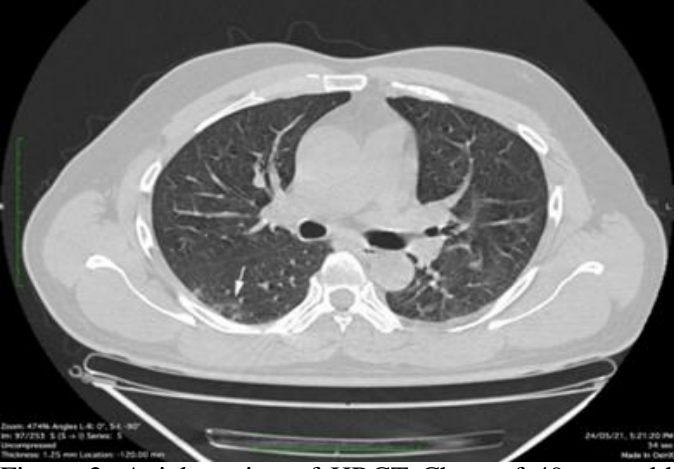
Figure 2: Axial section of HRCT Chest of 49-year-old male after 2 doses of Covishield showing faint ground glass opacities in superior segment of right lower lobe. (CTSI = 2/25).

Table 4: Distribution of patients based on immunization status in relation to ct score.