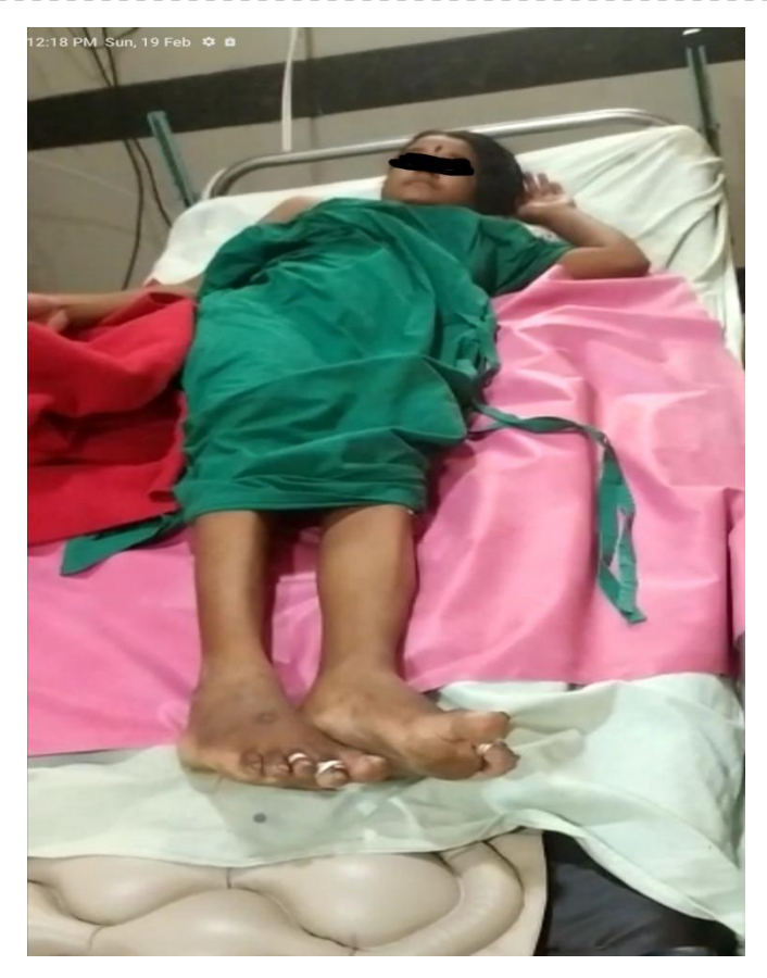
Fig.1: showing initial condition of patient, not able to walk or stand

A 30 year old female, farmer by profession, was brought to our orthopaedicout patient department with complaints of weakness of lower limb and inability to bear weight and inability to walk since last 15 days.