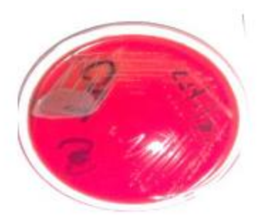
Figure 6: Colony formed after conventional preparation.