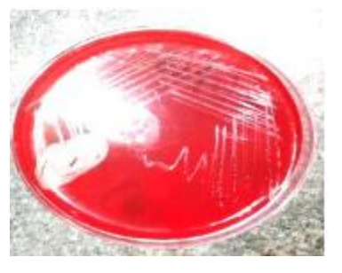
Figure 5: On Blood Agar Medium Initial Colonies Formed