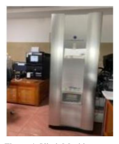
Figure 4: Vitek Machine