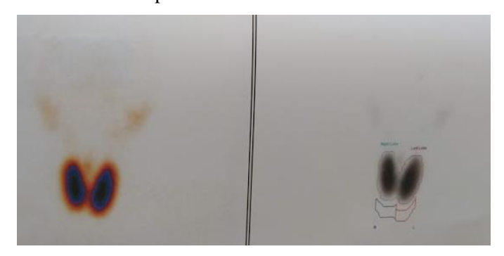
Figure 2: THYROID SCAN WITH 99mTc: Thyroid gland uptake percentage of Technetium- 35.7% She was started on Methimazole at a dose of 10 mg thrice daily and Propranolol at a dose of 40 mg thrice a day. She gradually improved clinically and

USG abdomen done showed mildly enlarged liver (15.4 cm) with mild coarse echo texture. LKM 1, Liver Kidney Microsome Antibody (Serum Immunofluorescence) was negative, hence ruling out Autoimmune Hepatitis.