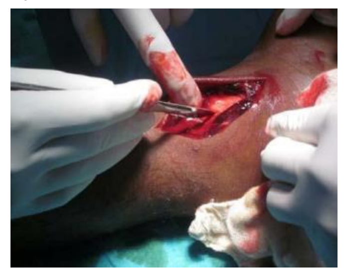
Figure 5: Exposure of Medial Malleolus