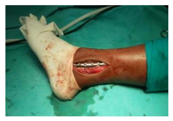
Figure 3: Reduction And Fixation with Semi Tubular Plate