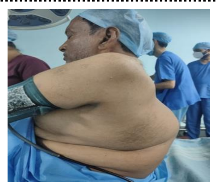
Fig. 2: Patient with severe congenital kyphoscoliosis