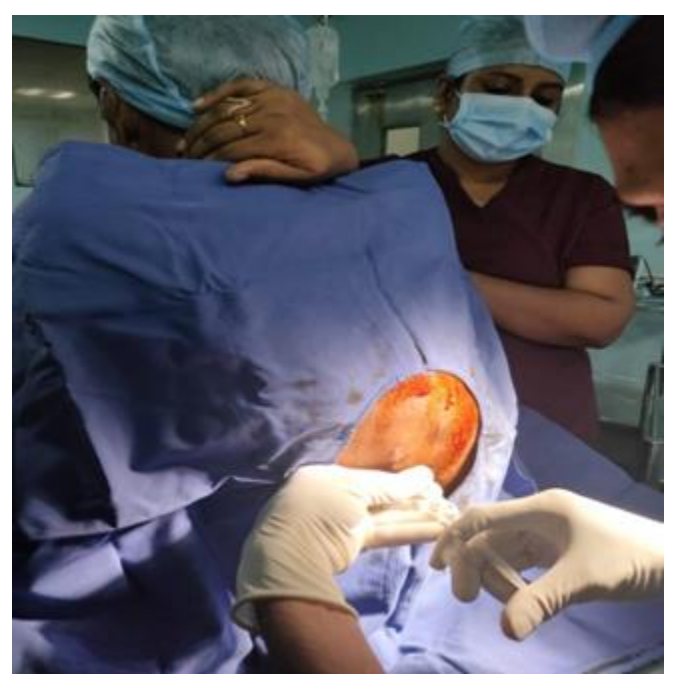
Fig 3: Subaracnoid space entered using ultrasound Discussion

In Scoliotic patient, vertebral bodies are rotated axially, with their spinous processes facing into the concavity of the curve. The degree of spinal rotation is difficult to estimate clinically and by Xray. Ultrasound can help to estimate the depth and location of the epidural space. One study has previously measured vertebral rotation in scoliotic patient using ultrasound imaging and reported