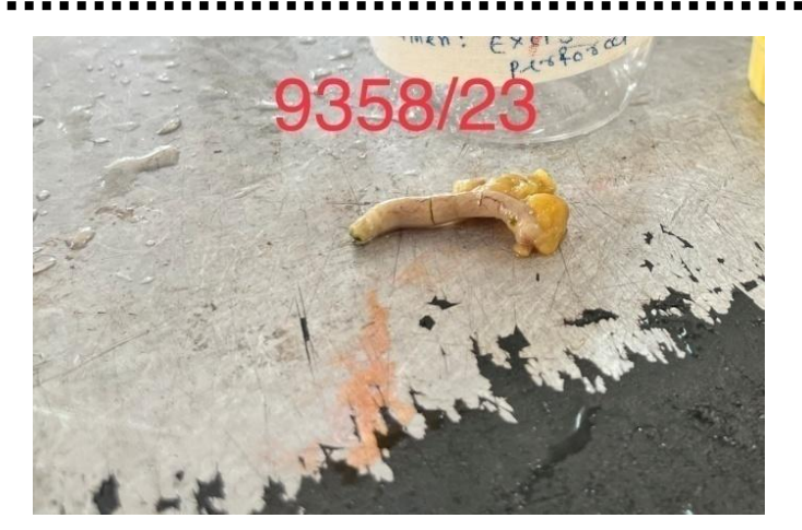
Fig. 1: Showing specimen of appendix with attached mesoappendix which was swollen, 3.7 cm in length and 0.5 cm in maximum diameter. External surface was grey white and showed congested vessels along with perforated area measuring 0.1 cm which was 0.5 cm away from the tip of appendix. Cut section showed lumen filled with faecal material.